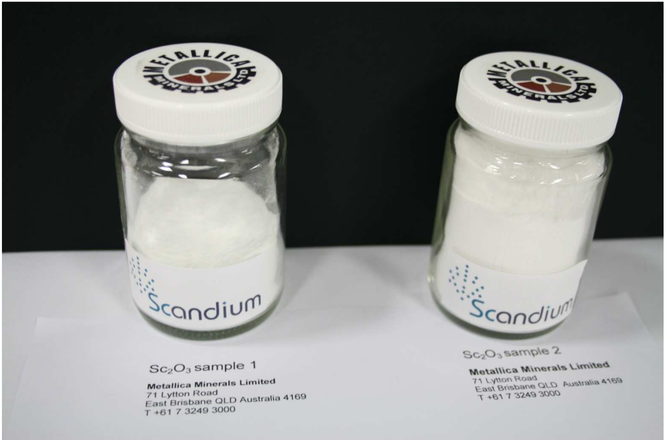
Figure 2: Scandium oxide produced by Metallica

Scandium oxide appears as a free flowing white powder, as seen in Figure 2 below: